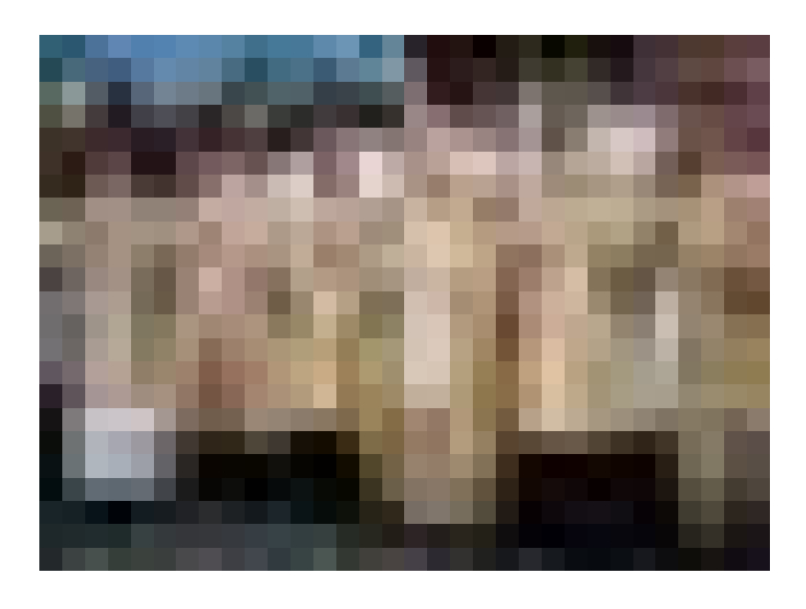
(Picture: Cardinal Ratzinger visits FSSP motherhouse and offers Mass on Easter 1990)

have two British deacons coming up for priestly ordination before next summer, while three British seminarians are on formation in our seminaries.