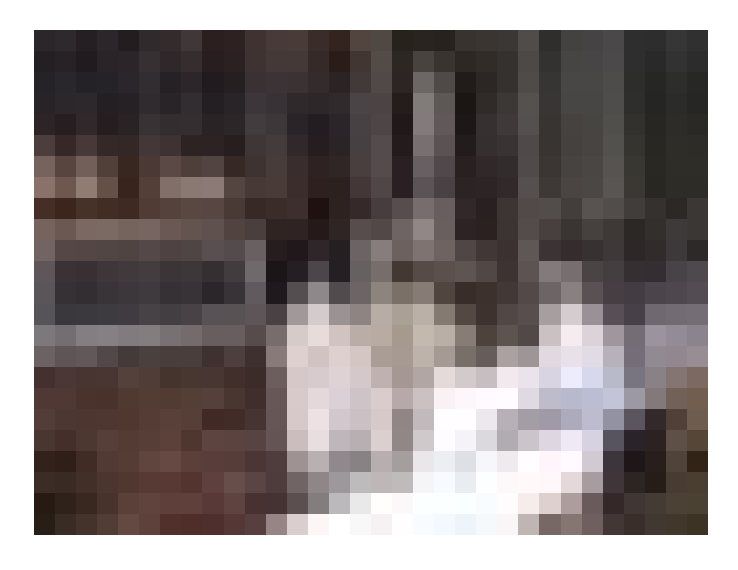
(Pontifical Benediction, Spanish Place, November 2008)

In the next semester a visit is being envisaged in Yorkshire where several friends of the Fraternity and Confraternity members live.