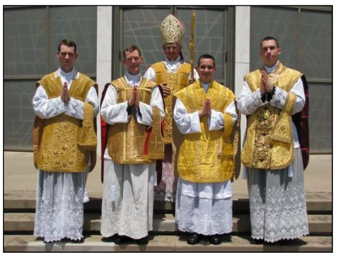
(Picture: Prefect Emeritus of the Congregation for Clergy and President of the Ecclesia Dei Commission Cardinal Castrillon Hoyos with four FSSP priests just ordained by him at our FSSP seminary in Lincoln, NE on 30<sup>th</sup> May 2008.)

We now take the liberty of transposing Sir Ernest's virile but very 'horizontal' challenge into Catholic and supernatural terms: "MEN WANTED: FOR SPIRITUAL JOURNEY. ETERNAL REWARD, ENLIGHTENING OF INTELLECT. SAFETY IN GRACE AND BROTHERHOOD, TIME OFF EVERY THREE MONTHS. GROWTH IN KNOWLEDGE, IN HUMILITY AND IN FILIAL LOVE FOR GOD GUARANTEED. FSSP SEMINARIES". We only now add some practical aspects which would have clashed a bit in the enumeration above,